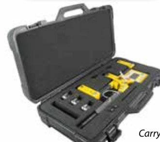
Carry case included

Dillon also manufactures highly accurate electronic and mechanical dynamometers and crane scales.